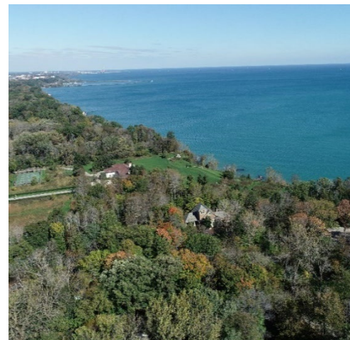
CLCJAWA Raw Water Pump Station overlooking Lake Michigan.

For more information on lead in drinking water, testing methods and steps you can take to minimize exposure, contact the Safe Drinking Water Hotline at (800) 426-4791 or go to http://www.epa.gov/safewater/lead .