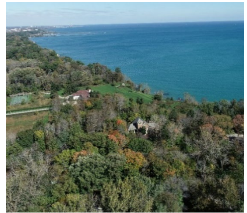
CLCJAWA Raw Water Pump Station overlooking Lake Michigan.

For more information on lead in drinking water, testing methods and steps you can take to minimize exposure, contact the Safe Drinking Water Hotline at (800) 426-4791 or go to http://www.epa.gov/safewater/lead .